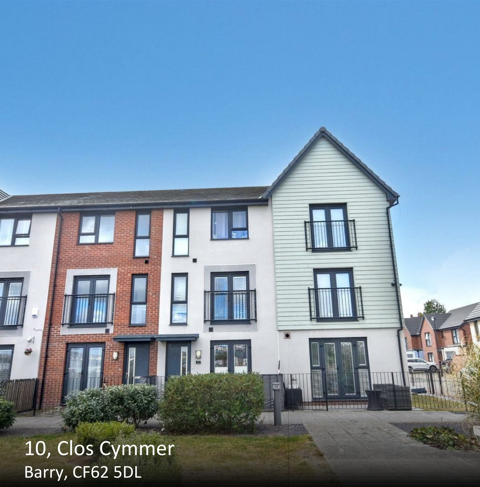
10, Clos Cymmer Barry, CF62 5DL